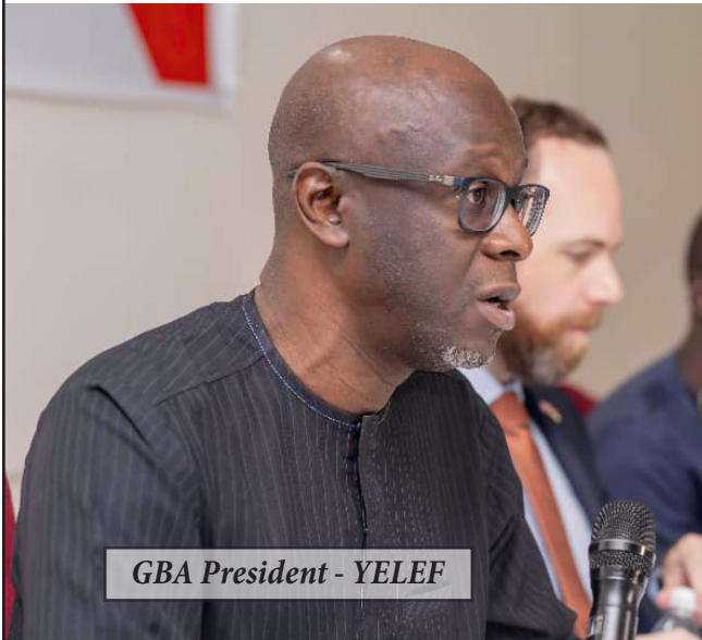
GBA President - YELEF