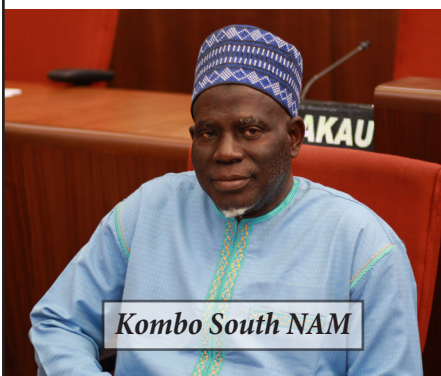
Kombo South NAM