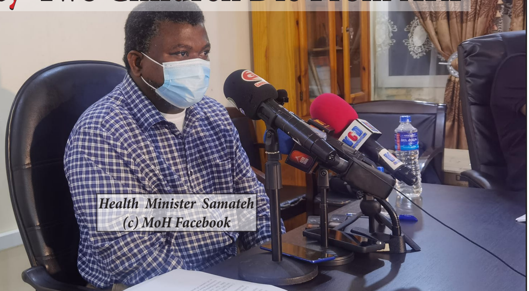
Health Minister Samateh