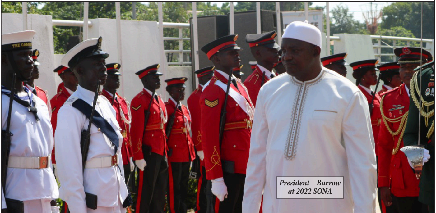
President Barrow at 2022 SONA