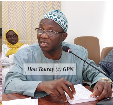
Hon Touray