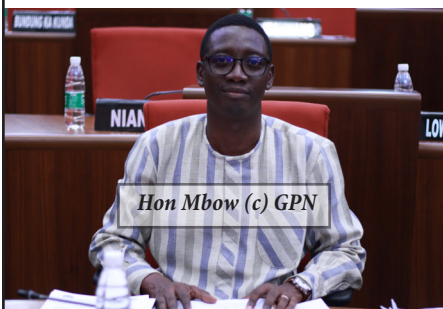
Hon Mbaw

The Gambia's Representatives at the Pan African Parliament (PAP) have recommended for the Gambia's National Assembly to liaise with the Gambia Government to lobby to host the Ordinary Session of the Pan-African Parliament. Parliamentarians believe that hosting the PAP can help boost the country's economy.