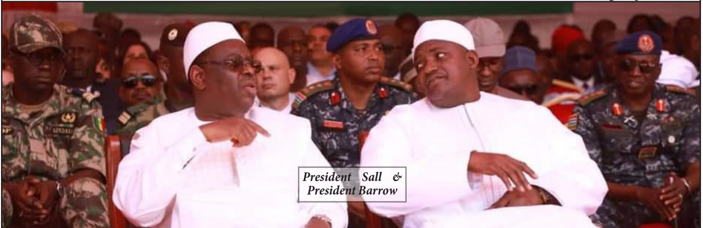
President Sall & President Barrow