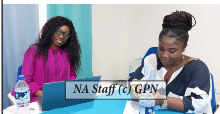
From Back Page