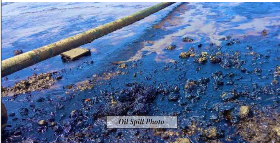
Oil Spill Photo