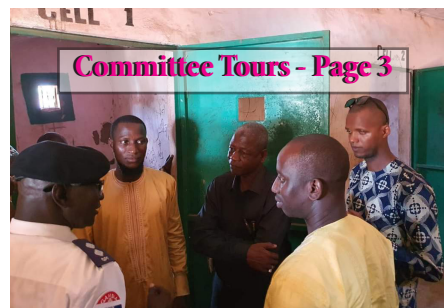
Committee Tours - Page 3